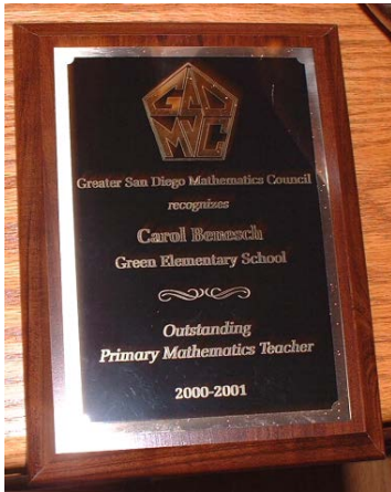
CAROL'S AWARD PLAQUE